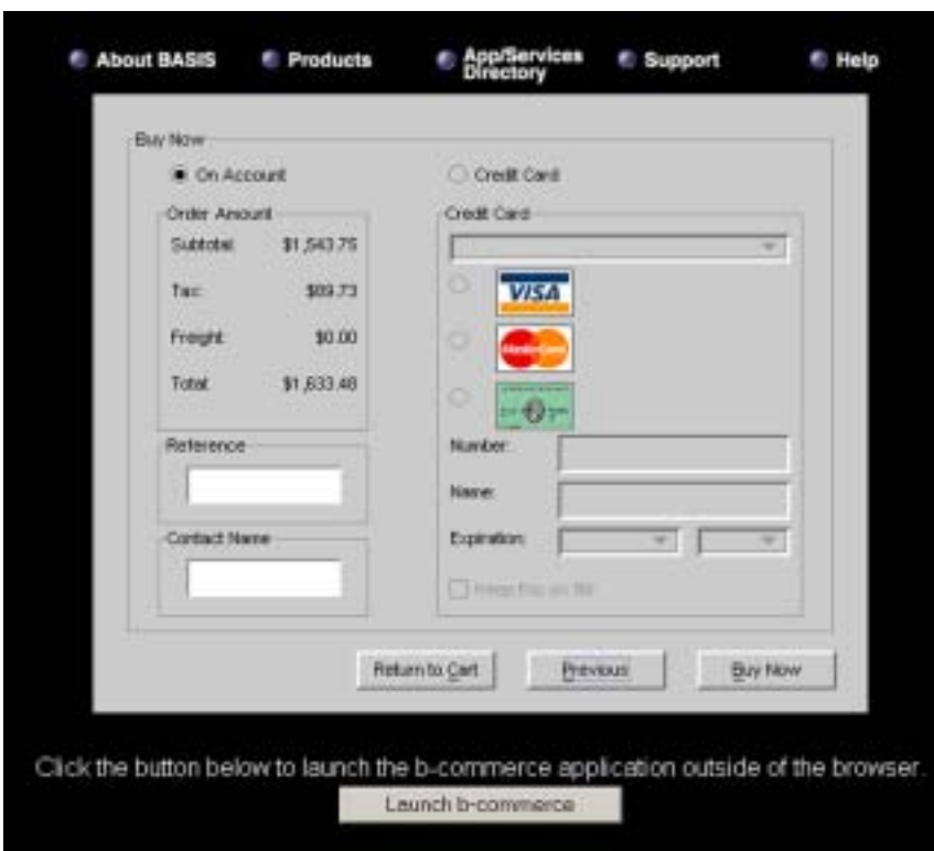
Figure 8. Payment Screen.

The final purchasing step occurs on the payment screen, as shown in Figure 8 . This screen displays the total amount due, including all applicable tax, shipping, and handling charges. The b-commerce system accepts VISA, MasterCard, or American Express, and extends credit for customers with pre-approved Net terms status.