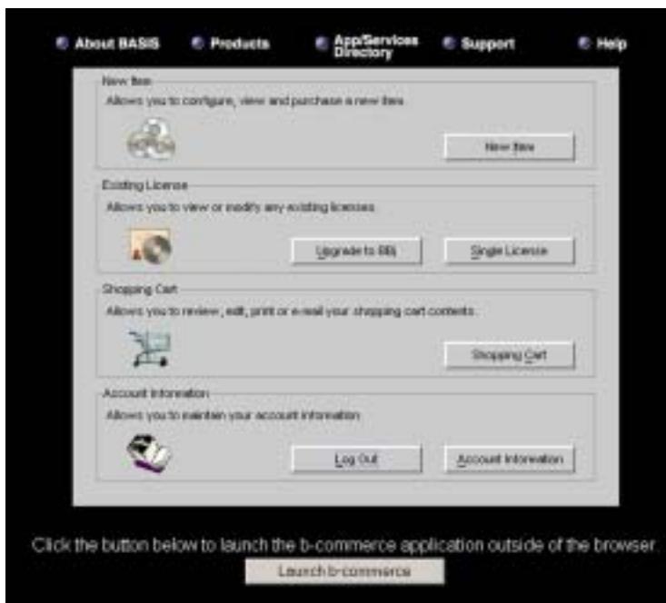
Figure 2. b-commerce Main Menu.