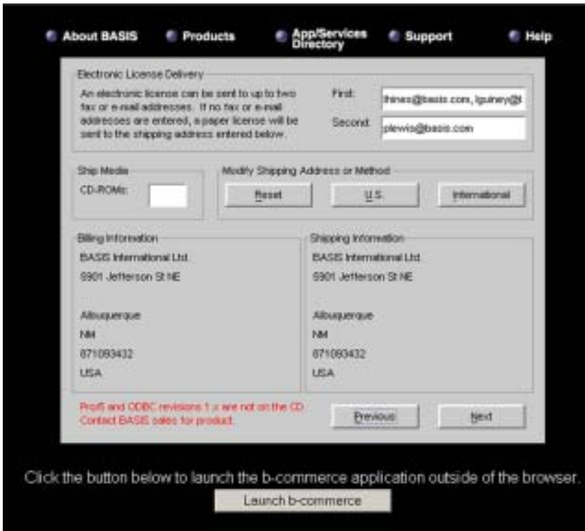
Figure 7. BASIS Product CD and Checkout Screen.

After completing the changes and approving all line items, proceed to the checkout screen by clicking on the Checkout button. Figure 7 shows the screen containing the option to select whether to receive a BASIS Product CD. Enter the quantity of CDs and confirm the shipping information located in the lower right hand corner.