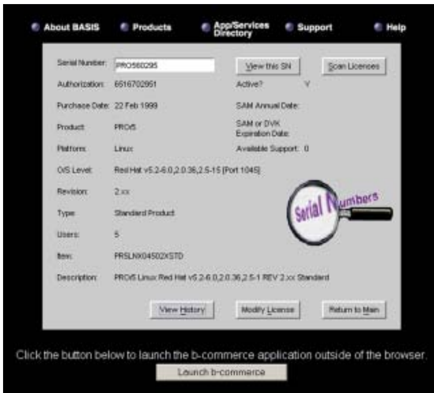
Figure 4. Existing License Screen.

Figure 3 shows the screen for ordering new items. This screen provides generalized access to all of the functionality contained within the b-commerce application. The various functions allow the modification of an existing license, purchasing a new product license, viewing the shopping cart's contents, access to account information for the account logged on, and logging out of the system.