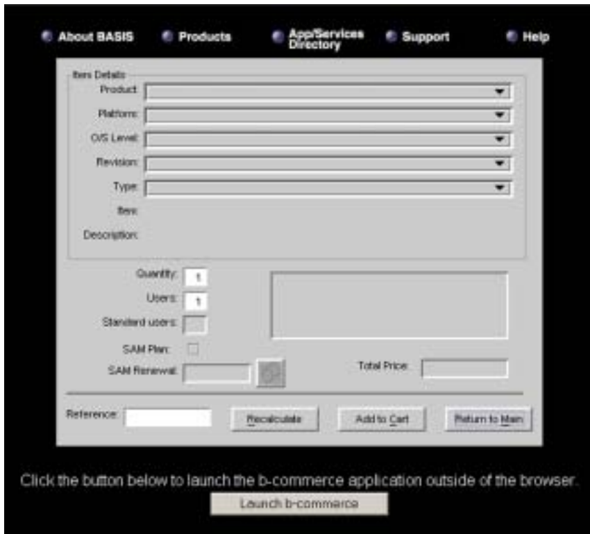
Figure 3. Item Detail Screen.