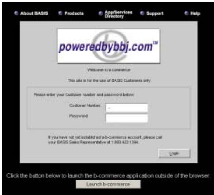
Figure 1. b-commerce Login Screen.